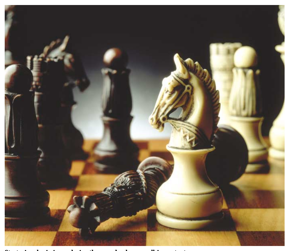
{\bf Strategic\ submissions:\ playing\ the\ game\ has\ become\ all-important.}

Evaluations of scientists depend on numbers of papers, positions in lists of authors, and journals' impact factors. In